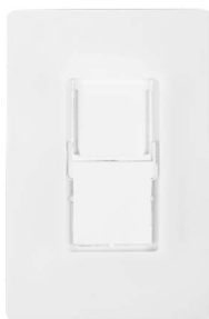
WP Wall Plate (not included)